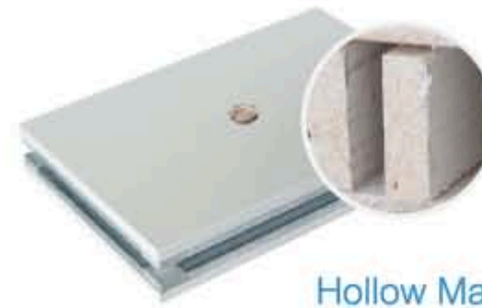
Hollow Magnesium Oxide (MgO) Board