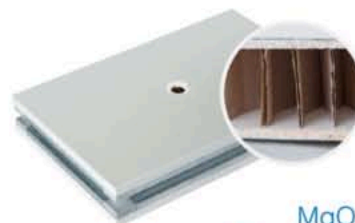
MgO Board & Paper Honeycomb