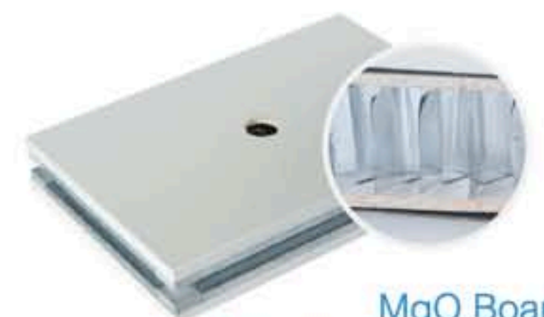
MgO Board & Aluminum Honeycomb